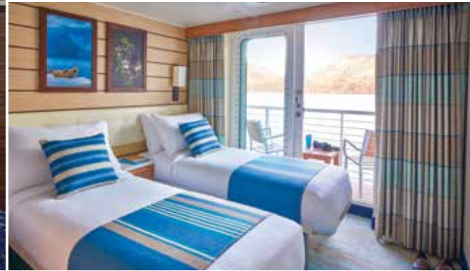
Clockwise above: the lounge, with 270° views, is the hub of the expedition community; Category 5 cabin is our most spacious; Category 4 cabin with single beds (which can be converted to queen) and private step-out balcony.

CATEGORY 1: Main Deck #301-306 Cabins face outside with two portholes, feature two single beds that can convert to a queen, a writing desk, two nightstands, full length mirror and a closet.