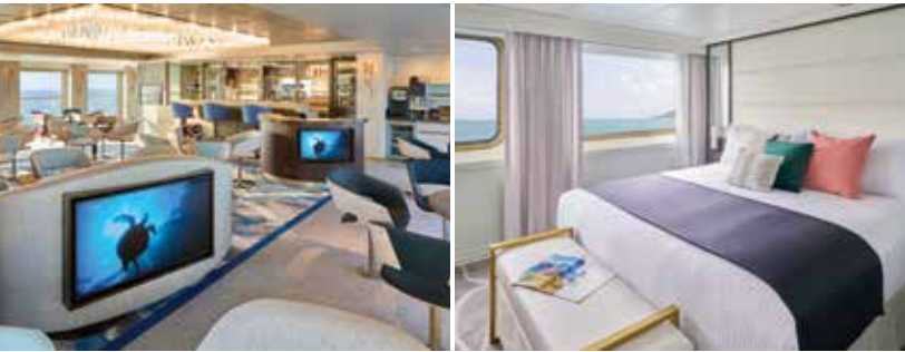
Clockwise from top: National Geographic Islander II; Suite; The Cove lounge.